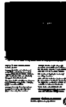
A Menace to Patients from the American Medical Association