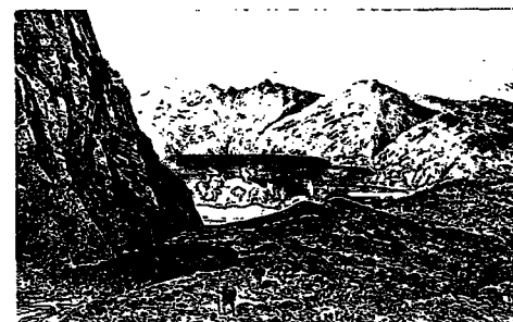
Laguna Verde in El Azufral Volcano. Drawing by Riou, 1879