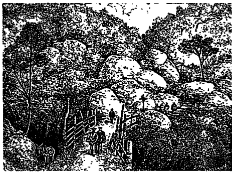
On the bridge of Icononzo. Drawing by Riou, 1884