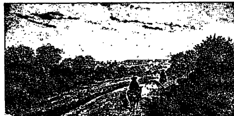
Arrival in Popayán. Drawing by Riou, 1879