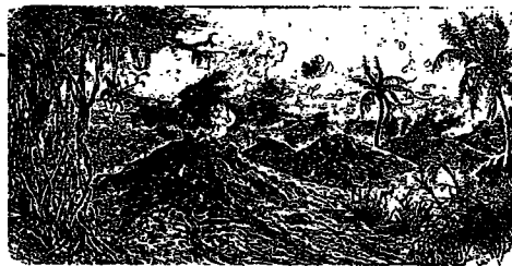
Volcanos of Turbaco. Drawing by Riou, 1872