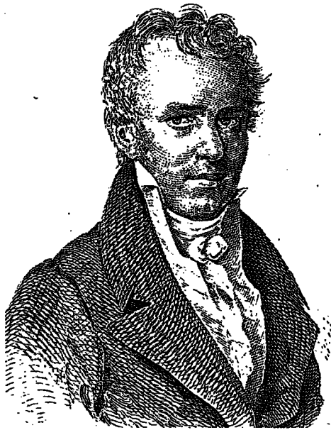
Baron Alexander von Humboldt. Drawing by Bailly, 1842