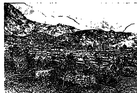
Panoramic view of Bogotá. Drawing by Riou, 1887