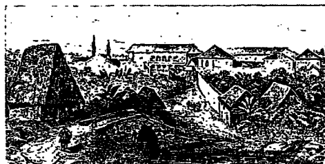
Houses at the entrance to Popayán. Drawing by Riou, 1879