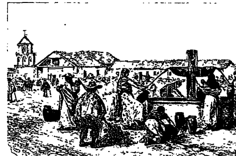
Church and Town Square of Facatativá. Drawing by Riou