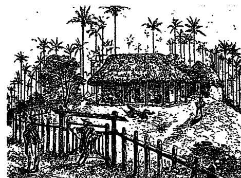
Las Cruces hacienda in El Quindío. Drawing by Riou, 1884